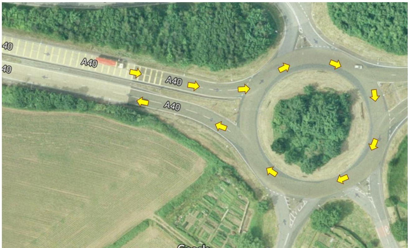
Aerial view of the turning point at 4.94 miles

We'll have marshals stationed at the turning point but please remember that they're there for guidance only and have no authority to control traffic. The R10/17 is a simple out-and-back course but several roads converge at the turning point, as shown here: