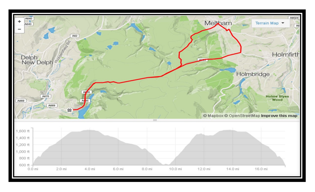
The route can be viewed here https://www.strava.com/routes/4723146