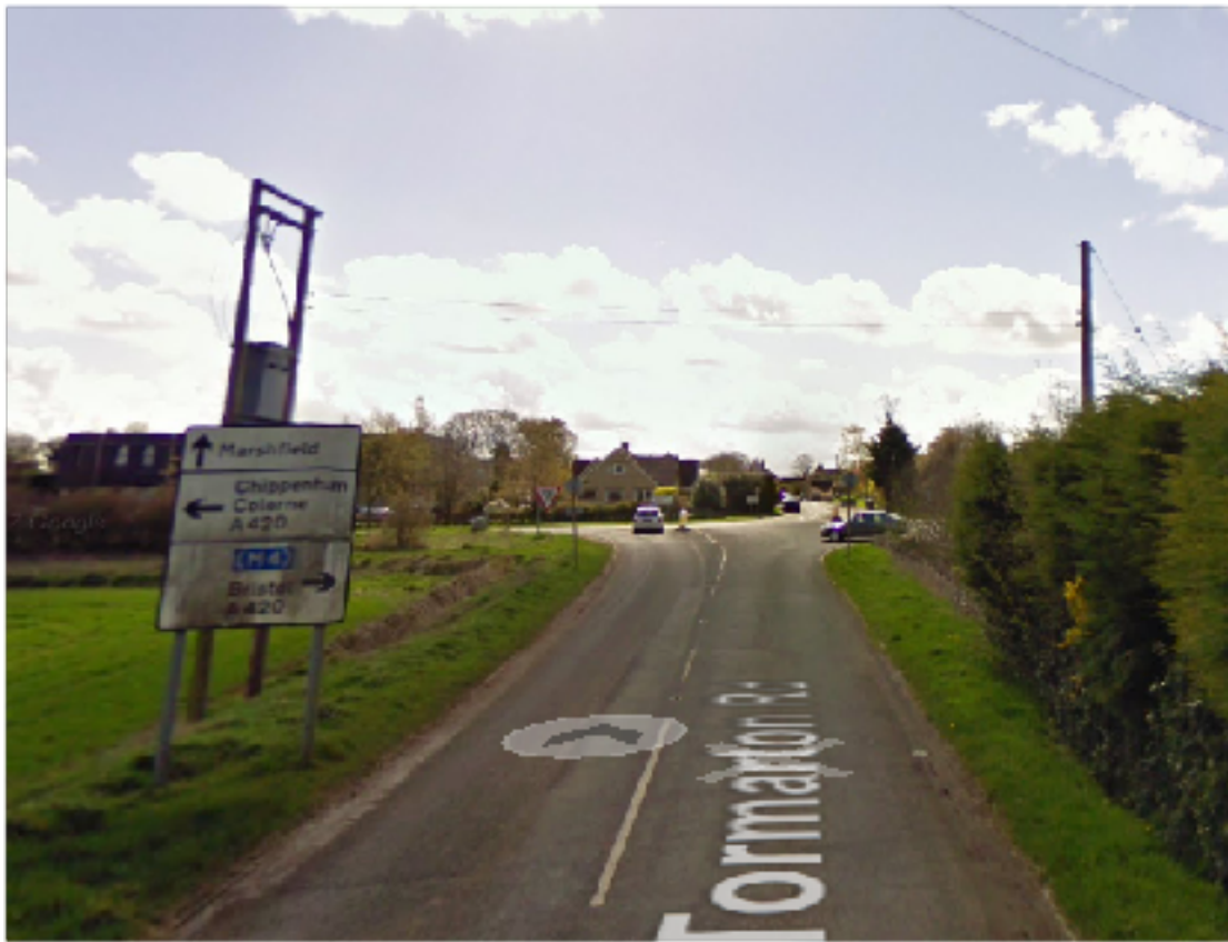
Left turn A420 onto B4039 - (Warning - Y shaped junction, be prepared to give way from right) (10 miles approx.)