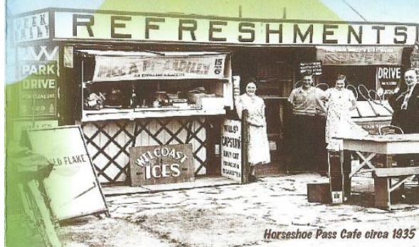
Horseshoe Pass Café circa 1935

At a height of 1367 ft above sea level you will be overawed by the stunning scenery enjoying views out towards the North Wales coast, the Clwydian Hills and Snowdon mountains.