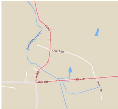
Left turn at Lauriston towards Glenlochar and left turn on to A713