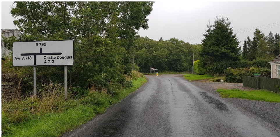
Approaching the left turn on to A713 – CAUTION.