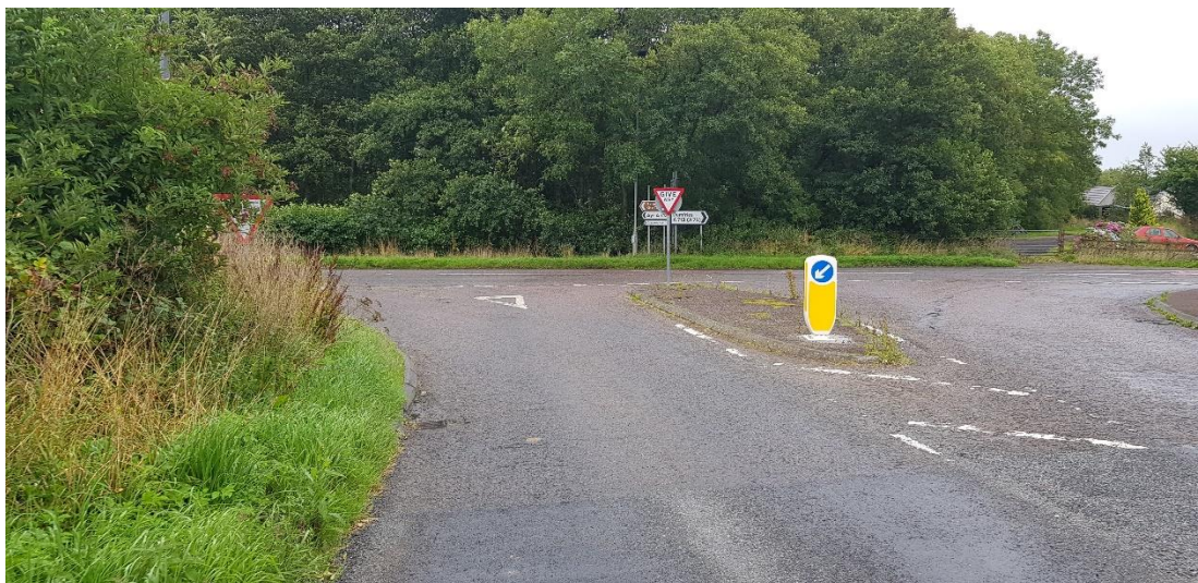
Approaching the left turn on to A713 – CAUTION.