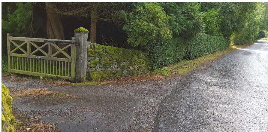
The Start Area at Ardlaggan. See below for info on Alison's offer.