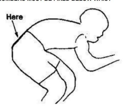
NO TIME MAY BE RECORDED IF NUMBER IS NOT CORRECTLY POSITIONED

CTT REGULATION: ALL RIDERS MUST START WITH BOTH A WORKING FRONT AND REAR LIGHT ATTACHED TO THEIR MACHINE