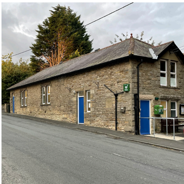
Catton Village Hall

Please ensure that numbers are returned after the event and remember to sign off, otherwise your time won't be recorded in the official results.