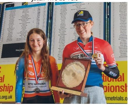
National 10 Junior Girls Podium