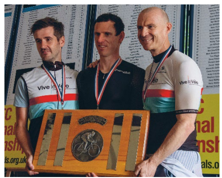
National 10 Mens Team - Chapeau! Vive Le Velo

Due to concerns and uncertainty surrounding possible re-introduction of restrictions in response to the Covid-19 Omicron variant, Champions Night was regrettably cancelled again this year