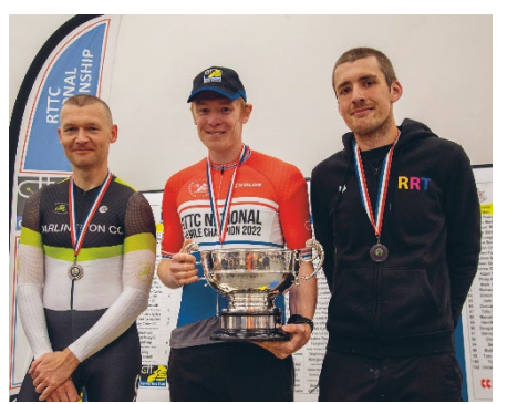
National 50 Championship – Mens Podium