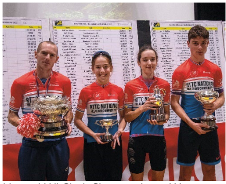
National Hill Climb Championships - Winners