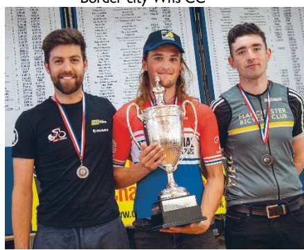
National 100 Mens Podium