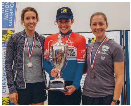
National 50 Championship - Womens Podium