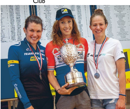
National 100 Womens Podium